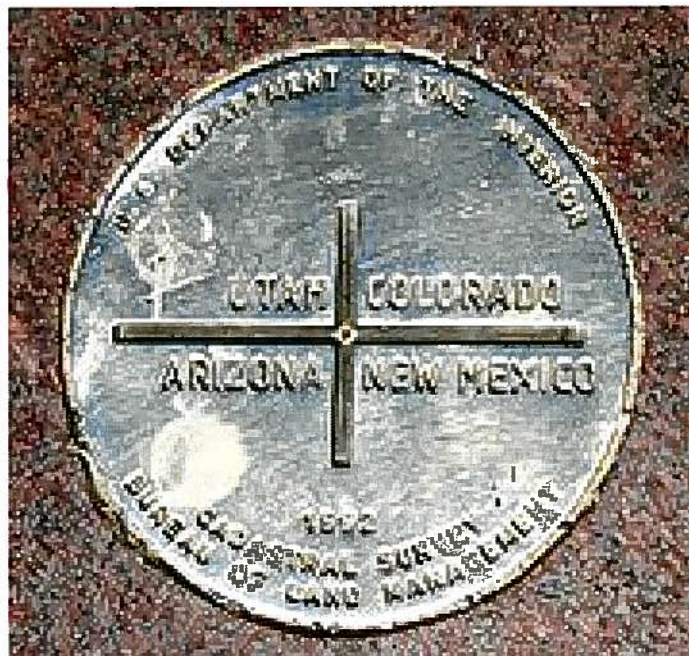
The marker at the Four Corners point.

NGS is responsible for defining, maintaining, and providing public access to the NSRS – a consistent national coordinate system that provides the foundation for mapping and charting; some state boundaries; transportation, communication, and land records systems; as well as scientific and engineering applications. More information about NGS and the various components of the NSRS can be found at: http://www.ngs.noaa.gov . NGS is not normally involved in boundary-related issues and is providing the information contained in this document simply as a statement of clarification of the pertinent facts and background regarding the Four Corners monument. The field notes and plats for the remonumentation of the Four Corners monument and the surveys/resurveys of the state boundary lines can be obtained from the BLM at: http://www.gloreCORDS.blm.gov/ .