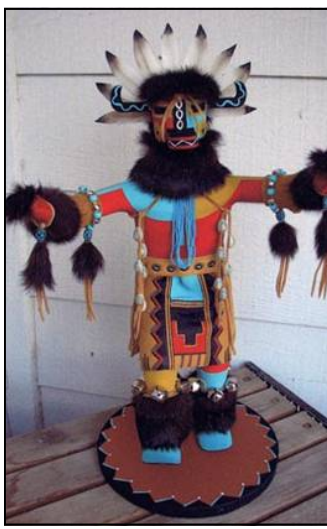
This is a picture of the Kachina our Chapter has donated to the International Conference for the Silent Auction.